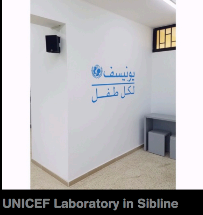
UNICEF Laboratory in Sibline