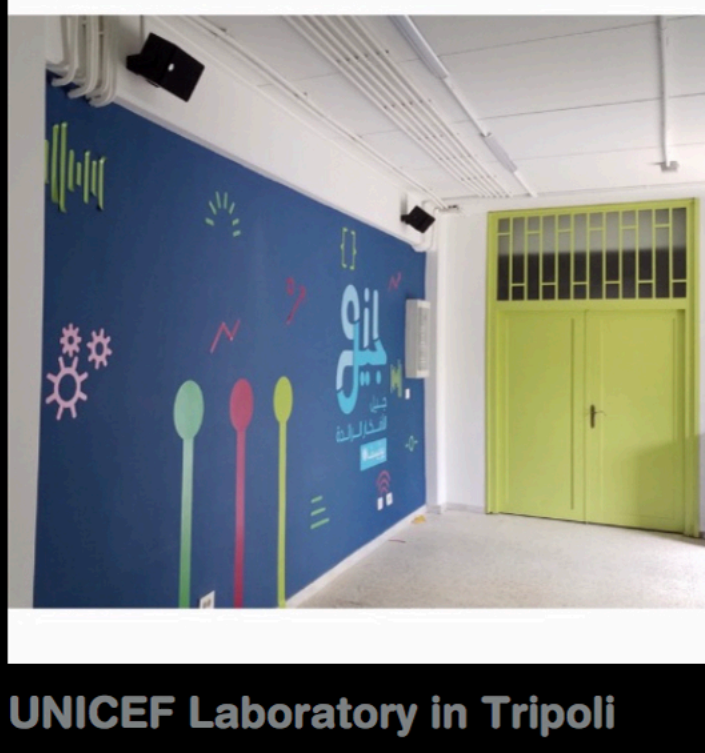
UNICEF Laboratory in Tripoli